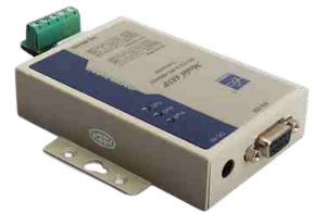
RS-232 to RS-485/422 Converter