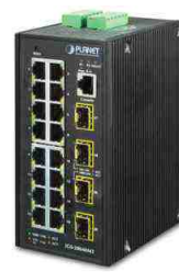
Full Gigabit Managed Ethernet Switch