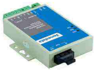
Serial to Fiber