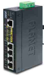
L-2, Managed Ethernet Switch