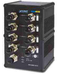
IP67 Rated Ethernet Switch