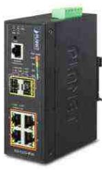
Compact L-2 POE Switch