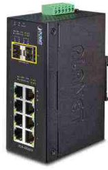
8+2 UnManaged Ethernet Switch