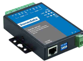
2-Port RS-232/485/422 to Ethernet