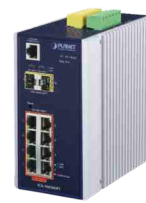
E-Mark Compliant Switch