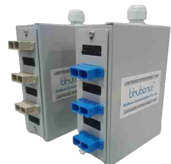
Compact DIN RAIL Mount LIU