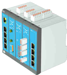
Modular industrial router MRX