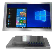
IP69K Stainless Steel Panel PC