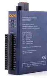
Modbus-RTU/ASCII To ProfiNet Converter