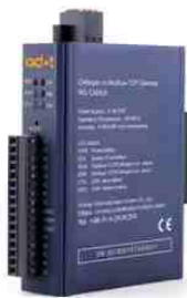
CANopen To Modbus TCP Converter