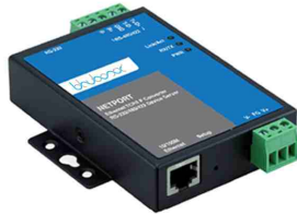
1-Port RS-232/485/422 to Ethernet