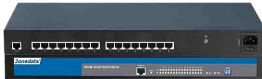
16 Port 232/485/422 to Ethernet