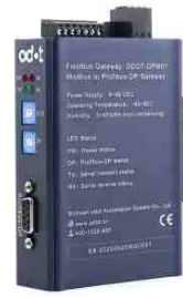
Modbus-RTU To Profibus-DP Converter