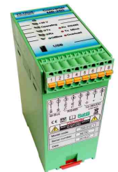
M-Bus to Modbus (RS485) Converter