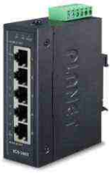
Un-Managed Ethernet Switch