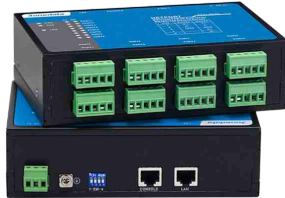
8 Port 232/485/422 to Ethernet