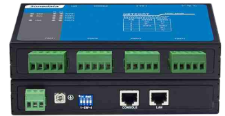
Ethernet-Modbus Gateway to 4-Port RS-485/422