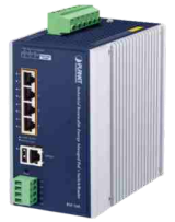
Renewable Energy Switch