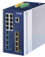
L3 Managed 10G Switch