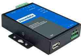
USB To RS-232/485/422