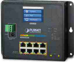
Wall-Mount Ethernet Switch